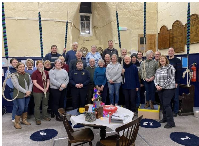
North Staffs Assn Ringers – AGM Dec 2023 @ St Mary's Stafford

The AGM was held at St Mary's Stafford, on Saturday 2 nd December 2023, and it was good to see so many people there, even though the weather was challenging.