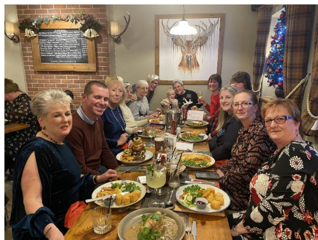
Dilhorne Ringers at their festive celebration