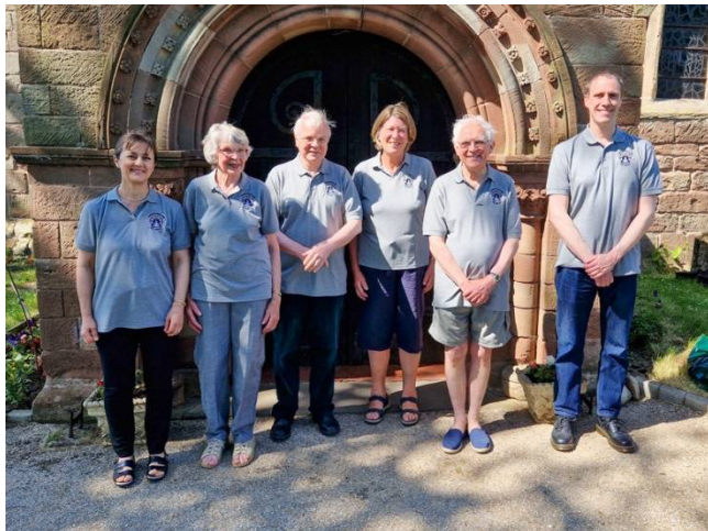
STONE BAND A – PLAIN BOB DOUBLES