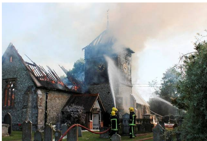
ST PETER'S CHURCH, having suffered a lightning strike.

the tower was successfully rebuilt and strengthened with a new steel frame, but the installation of the six Gillett & Johnson bells had to be deferred. The church re-opened in September 2022 and the improvements have attracted a vibrant congregation. The parish still owes around £200k for the work undertaken so far, including £155k on the substantial steel