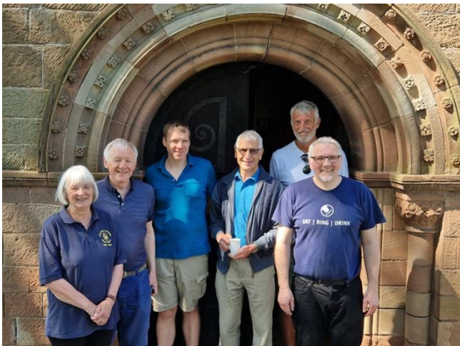
STAFFORD BAND – GRANDSIRE DOUBLES

Well done to everyone involved, and thanks to Church Eaton for hosting!