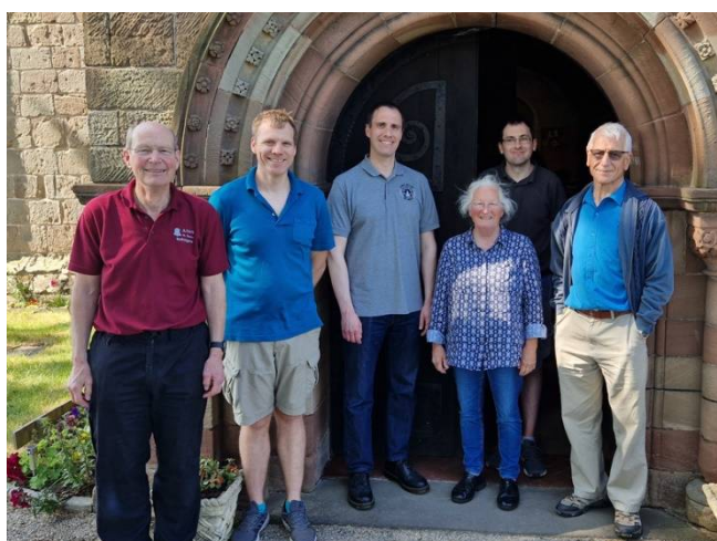
'CAMBRIDGE YOUTHS SCRATCH' - CAMBRIDGE S MINOR