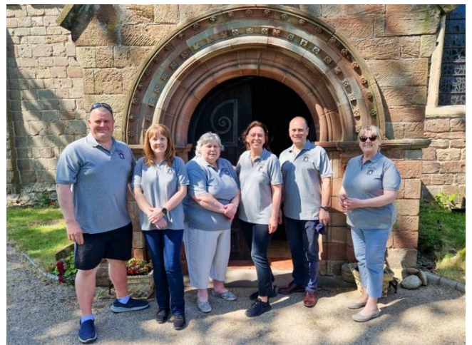
STONE BAND B – CALL CHANGES