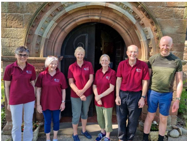
ALTON BAND - CALL CHANGES