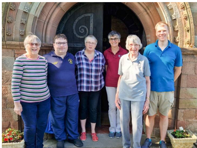
'YOUR CALL SCRATCH' CALL CHANGES