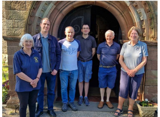
'DEVON ALMOST SCRATCH' – CALL CHANGES