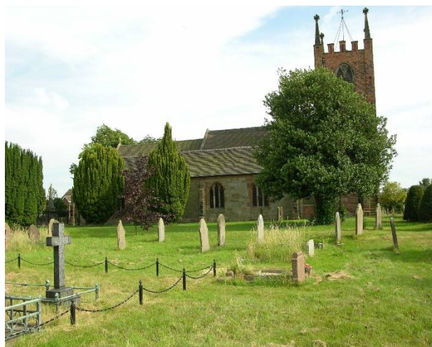
St Chad's Church Seighford, a grade 2 listed building

It was lovely to play our own small part on such momentous occasions.