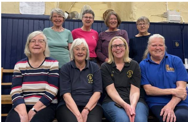
Staffordshire Ladies celebrating the coronation of King Charles III (2/2); first in method on the new bells at St Mary's