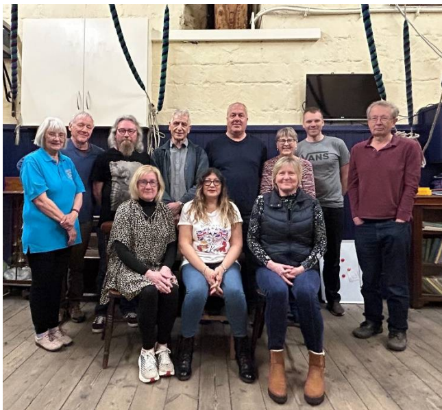
Stafford Ringers, with new ringers