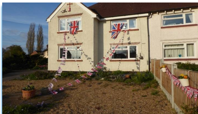
No pictures of ringers, but one of Kath's house and front garden, all decked out ready for the Coronation, from , as she describes herself as 'a right royal Enthusiast'!

No photos of the band however, apologies.