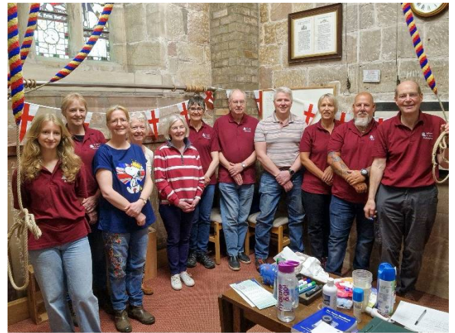
Alton, St Peter's

practice. Some of our newer ringers are now starting to ring Plain Hunt.