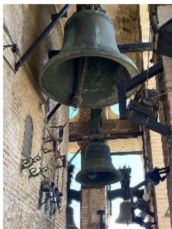
bells at Giralda Tower, Seville

When the news broke of Her Majesty's death on 8th September, I was on holiday in Spain having finally gotten around to our Andalusian adventure which had been put off because of Covid. The nearest I got to bells were those at La Giralda Tower, part of the amazing Cathedral in Sevilla. And so it was too, when it came to the Queen's funeral, I was still away. Sadly, I could not be part of that moment in history when collectively, bell ringers came together to contribute to the most beautiful soundtrack of one of the greatest events in this country.