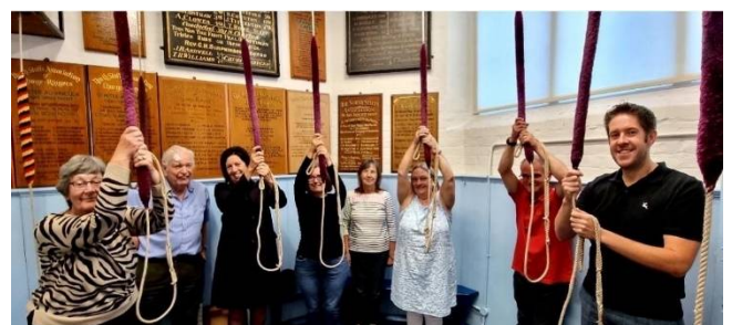
Stoke Minster ringers practising for the Queen's funeral

God bless her Majesty Queen Elizabeth II