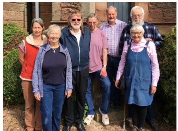
Keele band who rang in memory of the Queen on September 9 th